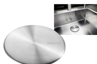
CapFlow Read more >>