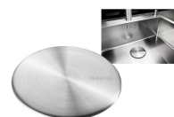
CapFlow Read more >>