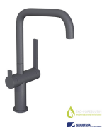
LAPETEK LINO-A Read more >>