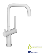
LAPETEK LINO-A Read more >>